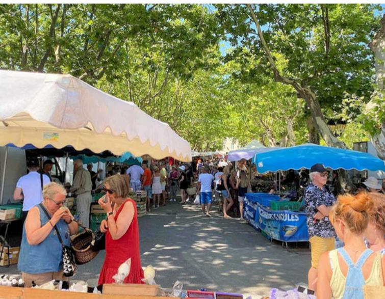
St Chinian Market under the plane trees.