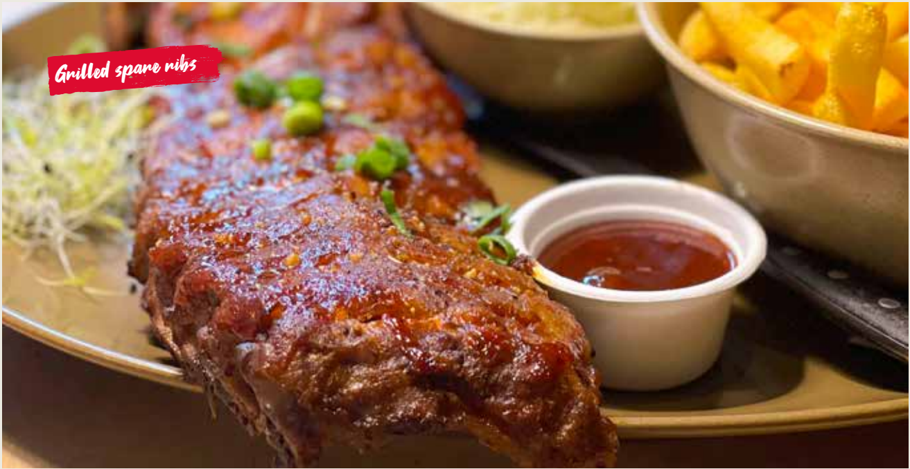
Grilled spare ribs