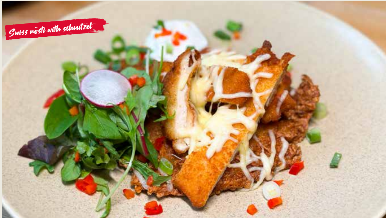
Swiss rösti with schnitzel