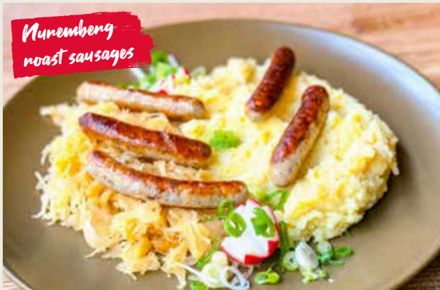
Nuremberg roast sausages