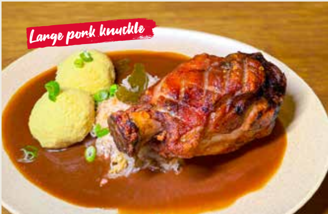
Large pork knuckle