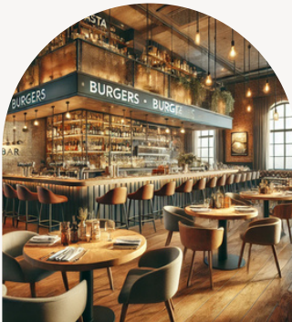
Francesa Restaurant Pasta, Burgers & more Ludwigstraße 27, 67547 Worms 10 minutes by car