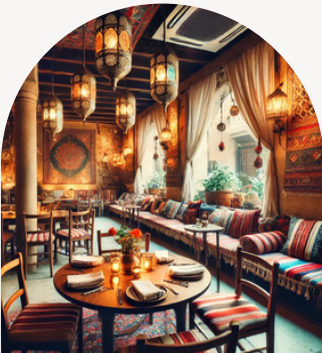
Sawa Rbina Arabian Restaurant Wilhelm-Leuschner- Str. 26, 67547 Worms 10 minutes by car