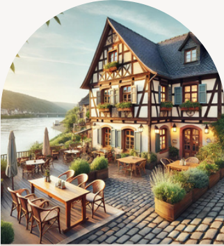
Altes Ruderhaus Local Cuisine Floßhafenstraße 7, 67547 Worms 12 minutes by car