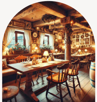
Wings Nibelungenstube Local Cuisine (Palatinate) Philosphenstraße 1, 67547 Worms 10 minutes by car