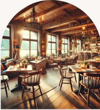
Hagenbräu Local Cuisine Am Rhein 3, 67547 Worms 12 Mminutes by car