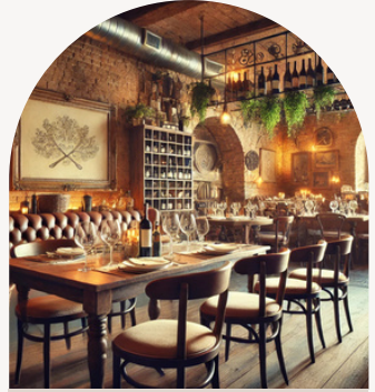
Würzburger Stube Italien Restaurant Weinsheimer Hauptstr. 69, 67547 Worms 12 minutes by car