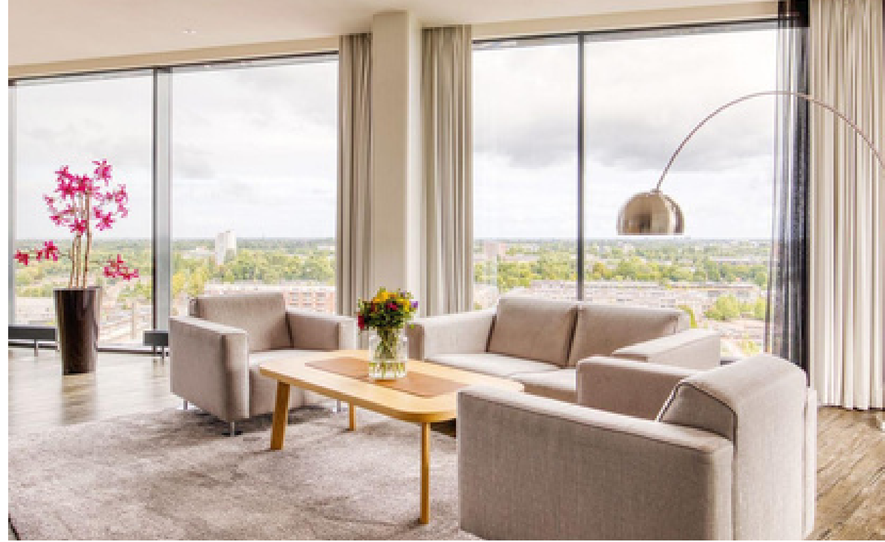
142 LUXURY ROOMS