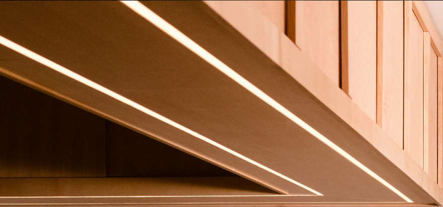
THE CATBIRD SEAT