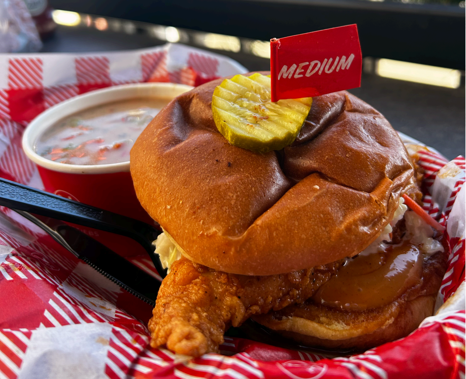
HATTIE B'S HOT CHICKEN