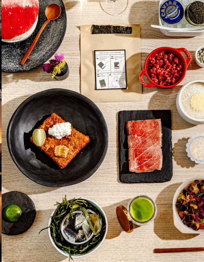
LOCUST PHOTOGRAPHED BY: VICTORIA QUIRK