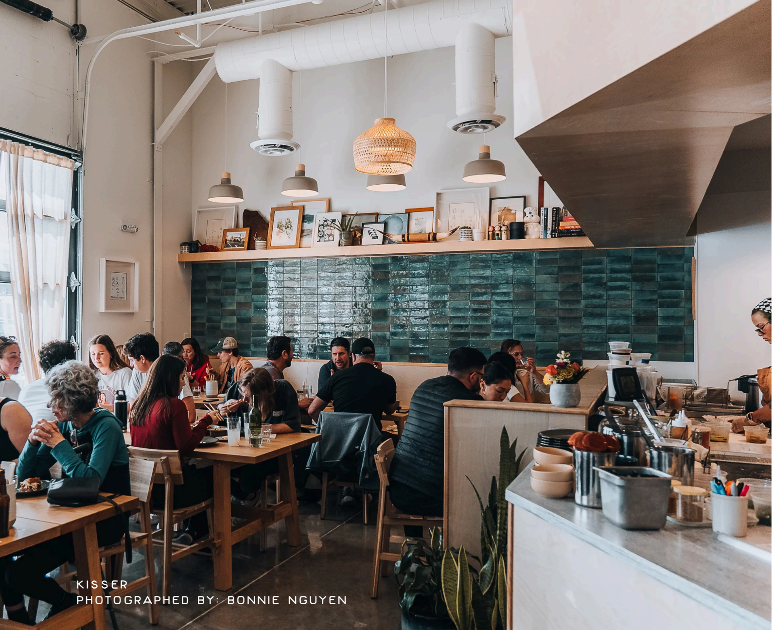
KISSER